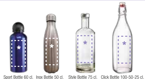
Sport Bottle 60 cl. Inox Bottle 50 cl. Style Bottle 75 cl. Click Bottle 100-50-25 cl.