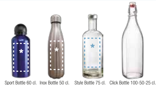
Sport Bottle 60 cl. · Inox Bottle 50 cl. · Style Bottle 75 cl. · Click Bottle 100-50-25 cl.